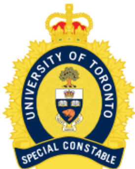
NEW SERVICE CREST

Our Service's re-branding to the Campus Safety Special Constable Service will better reflect the robust range of public safety services that we provide to the University community. It will also align us with provincial regulations set out in the Comprehensive Ontario Police Services Act, 2019. Below our Service's re-branding reflected our vehicle markings, uniform markings and our Service's crest (pictured below).