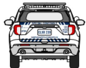
NEW VEHICLE MARKINGS