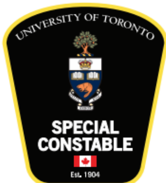
NEW UNIFORM PATCH